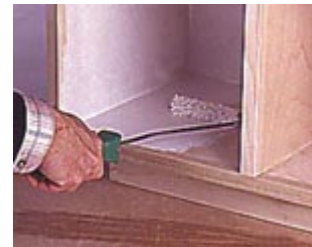
12--A small-diameter roller is used to apply the primer and top coat. The square end of the roller allows it to paint into corners.