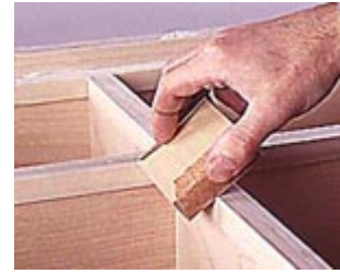
11--Put a small, crisp bevel on the facing and edge strips with a sanding block that you move perpendicular to the strip's edge.

Use a small-diameter, smooth-surface paintroller to apply a coat of latex primer to all cabinet surfaces ( Photo 12 ). Note that the long-handled roller used here has one end that is somewhat shaggy. This allows you to apply paint right to the corner. When the primer is dry, sand it lightly with 220-grit sandpaper. Finish the project by applying two coats of latex semigloss paint for an attractive finish.